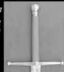
15th Century Two Handed Sword

Each sword features our full tang construction for Steel to Steel competition and our high fit and finish that Generation2 has been known for. This standard of quality is what makes our line of Historical Recreations in high demand for both the collector and re-enactor.