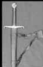
Black Prince Sword 14th Century

Each sword features our full tang construction for Steel to Steel competition and our high fit and finish that Generation2 has been known for. This standard of quality is what makes our line of Historical Recreations in high demand for both the collector and re-enactor.