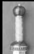
Roman Gladius Mainz 3rd & 4th Centuries