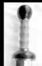
Roman Gladius Pompeii Blade 50 A.D. and Later