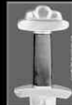
3 Lobed Pommel Viking Sword 10th Century