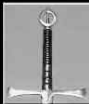
Irish Hand and a Half 1475 - 1525